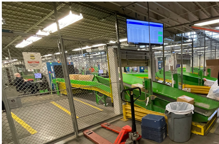
Figure 1. Conveyor Belt USPS Uses to Route Mail for CBP Screening at Chicago IMF

Within the Department of Homeland Security, U.S. Customs and Border Protection (CBP) plays a critical role in the Nation's efforts to safeguard the American public by interdicting illegal drugs entering the United States, including through international mail. The U.S. Postal Service (USPS) must present all classes of international mail to CBP at the first port of entry in the United States. This is generally an International Mail Facility (IMF) where officers inspect the mail to identify illegal drugs and other inadmissible items. CBP and USPS have an agreement for inspecting goods arriving via international mail. The agreement also guides facility managers when developing local procedures, ensuring timely flow of mail, and outlining responsibilities for maintaining equipment.