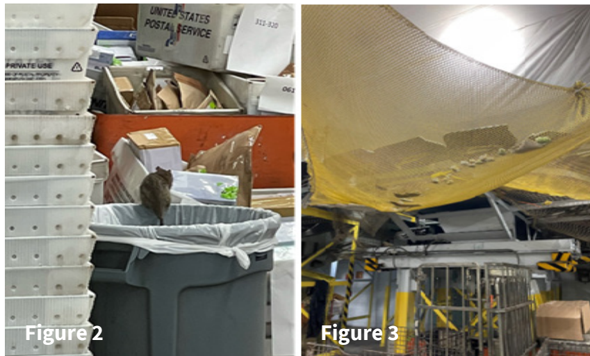
Figures 2 and 3. Chicago IMF Rodent Infestation (left) and Newark IMF Safety Net with Debris (right)

In addition to the deficiencies documented in the facility assessments, IMF and GSA officials identified other maintenance issues as early as 2018. At the Chicago IMF, CBP and GSA officials documented and requested resolution for trash blocking CBP's radiation inspection area that prevented access for emergency vehicles, repeat rodent infestations (see Figure 2), and a sink hole in the parking lot that impacted a nearby mobile lab. According to a Chicago IMF official, CBP reported the maintenance issues to USPS and GSA repeatedly. Additionally, at the Newark IMF we observed an area covered with a safety net that had filled with debris (see Figure 3). Newark mission support staff said that there are industry standards for safety features but were unaware if the net met these standards.