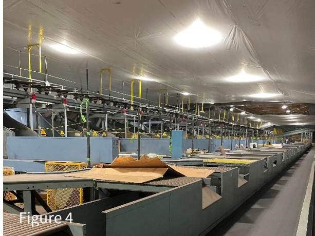
Figures 4 and 5. Unused and Inoperable Conveyor Belts Occupying Space at the Newark IMF (left) and the Honolulu IMF (right), respectively