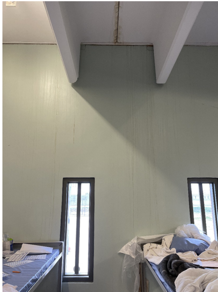
Figure 2. Water Stains from a Ceiling Leak that Dripped Down Walls, Observed on April 18, 2023

only temporary, short-term patches. We asked when the leaks would be fixed permanently, and facility staff said it could take up to 6 months to have it fixed by a specialist.