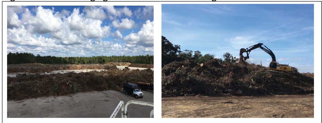
Figure 1. Disaster Staging Sites in Florida and Georgia