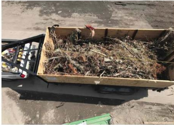
Figure 6. Image of a Disaster Debris Hauler