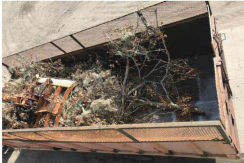
Figure 5. Image of Disaster Debris Hauler

Monitor called this 75 Percent Full, USACE would have called 25-30% *