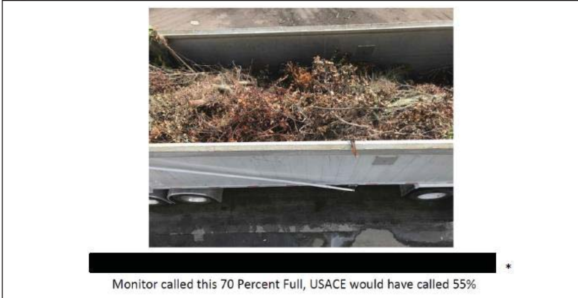
Figure 8. Image of a Disaster Debris Hauler