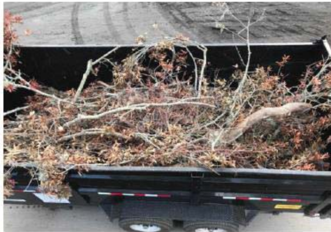
Figure 7. Image of a Disaster Debris Hauler

*The information was redacted because it could be used to identify the subrecipient.