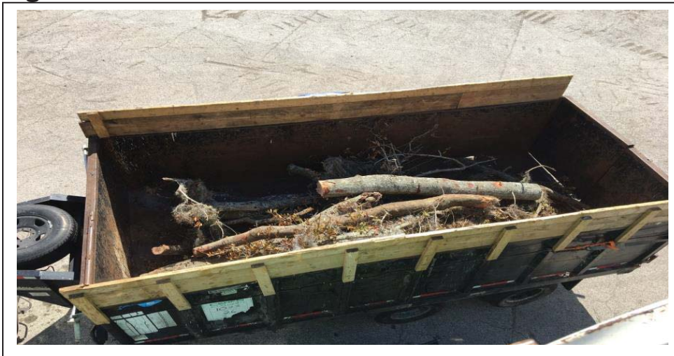
Figure 2. Disaster Debris Load Called at 95 Percent Full

Figure 2 depicts a load with large tree limbs and a stump. The truck driver convinced the monitor to estimate the load call at 95 percent full when more than half of the truck was empty.