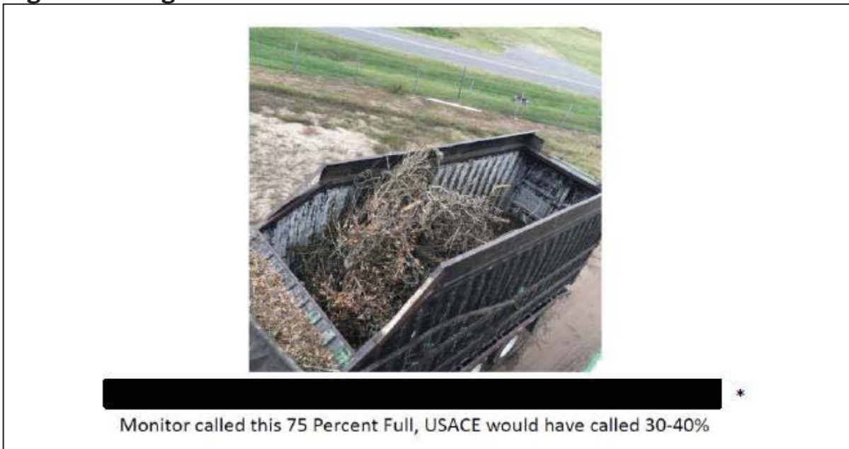
Figure 9. Image of a Disaster Debris Hauler

*The information was redacted because it could be used to identify the subrecipient.