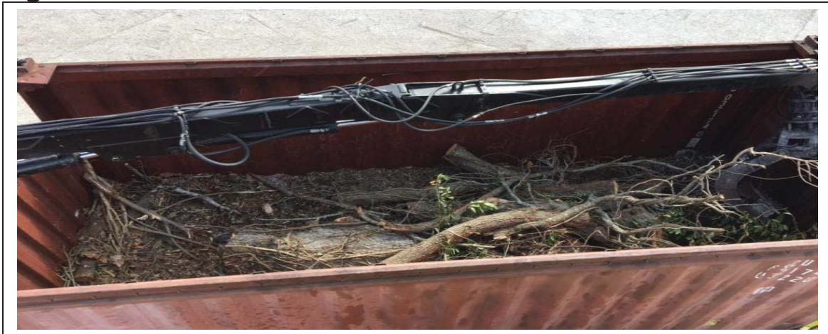
Figure 4. Disaster Debris Load Called at 50 Percent Full

Figure 4 illustrates a disaster debris hauler certified to carry up to 43 cubic yards. The monitor declared this load 50 percent full; however, the truck was significantly less than half full.