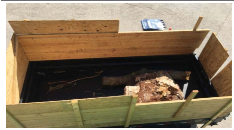
Figure 3. Disaster Debris Load Called at 50 Percent Full

Figure 3 depicts a load containing a large stump and tree branches. The monitor overstated the debris load at 50 percent of the truck’s capacity when more than 75 percent of the truck was empty. We requested copies of the truck certification; however, the subrecipient did not provide the information by the time we concluded our fieldwork in March 2018.