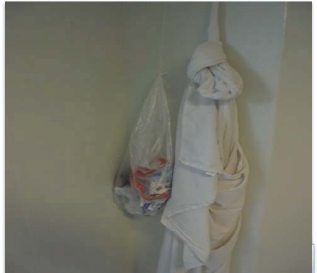
Figure 1. Nooses hanging from vents in detainee cells observed by the Office of Inspector General (OIG) at the Adelanto Center on May 1, 2018.