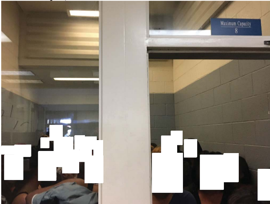
Figure 2: Overcrowding of Adult Females in PDT Holding Cell Observed by OIG on May 7, 2019