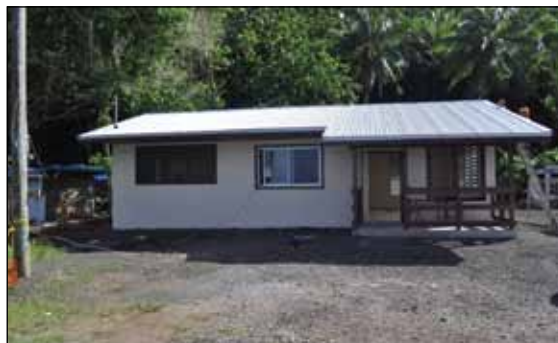
FEMA-Built Home in American Samoa