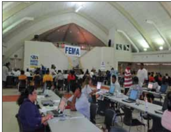
FEMA Disaster Recovery Center in Utulei, American Samoa

In September 2009, the U.S. Territory of American Samoa was affected by an earthquake, which caused a tsunami and subsequent flooding. This resulted in a Presidential disaster declaration for the territory. As part of our proactive oversight approach in disaster management, an Emergency Management Oversight Team (EMOT) was deployed to the territory shortly after the disaster. The team identified issues that FEMA needs to carefully monitor. American Samoa has a