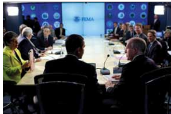
President Obama chairs hurricane briefing at the National Response Coordination Center

there was little evidence that support agencies are regularly included in planning meetings for an ESF mission, even though agency officials said that such coordination would be beneficial. FEMA needs to be fully prepared to provide community assistance after a disaster. Specifically, it needs to conduct long-term recovery exercises and clearly define procedures to identify and deploy needed recovery services to disaster-affected communities.