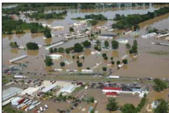
Flooding in Tennessee

FEMA generally has fulfilled its Emergency Support Function (ESF) roles and responsibilities under the National Response Framework. However, the agency can improve its coordination with stakeholders and its operational readiness. FEMA needs to better coordinate with stakeholders for all ESFs. For example,