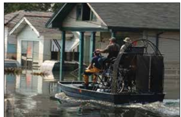
New Orleans, LA, September 10, 2005 – FEMA Urban Search and Rescue members search for residents impacted by Hurricane Katrina.

The Town of Dauphin Island, Alabama (Town), received a PA award of $4.6 million from the Alabama Emergency Management Agency (State), a FEMA grantee, for damages resulting from Hurricane Katrina, which occurred in August 2005. The award provided 100 percent FEMA funding for debris removal activities, construction of a 5-year emergency berm, and repair to roads. We reviewed costs totaling $4.4 million claimed