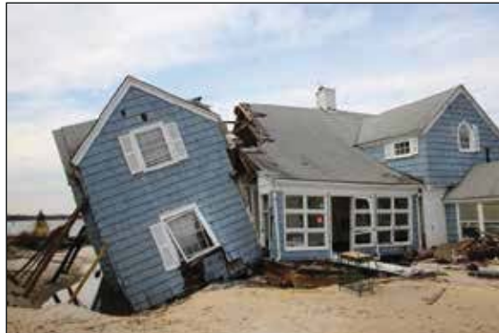
Mantoloking, NJ, January 16, 2013 — Home in this bayside community suffered severe damage after Hurricane Sandy struck the area.

http://www.oig.dhs.gov/assets/Mgmt/2013/OIG_13-37_Feb13.pdf