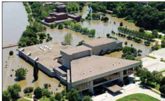
Hancher Voxman-Clap Complex when flooded in 2008.

FEMA Region VII officials did not correctly apply FEMA's 50 Percent Rule when approving funding to replace the Hancher Voxman-Clapp and Art Building East building complexes at the University of Iowa. Also, the decision to replace Art Building East was unsupported and likely based on inaccurate cost data. FEMA's 50 Percent Rule policy provides the decision-making tool to determine whether FEMA should fund the repair or replacement of a disaster-damaged building.