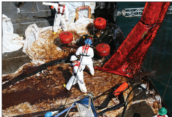
USCG recovers oil in the Gulf of Mexico less than one mile from the shoreline June 20, 2010.