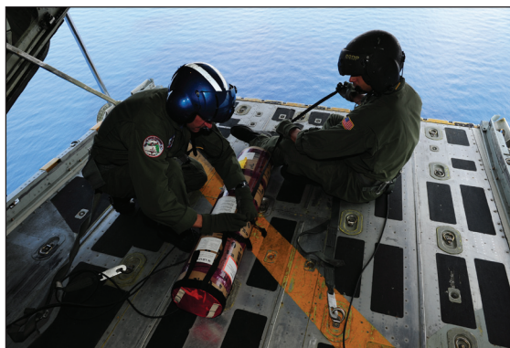
USCG aircrew members, from a C-130 aircraft stationed at USCG Air Station Clearwater, Florida, prepare to drop a satellite-enabled data marker buoy into the Gulf of Mexico to help track the spill on May 29, 2010.

However, the unprecedented size of this oil spill revealed weaknesses in USCG's existing processes for capturing indirect costs. As a result, USCG may not be able to bill for as much as $193.7 million in indirect costs. Additionally, USCG cannot bill as much as $38.7 million because its standard reimbursable rates instruction was not updated as scheduled, which would have been prior to the oil spill. USCG took immediate corrective action on issues identified during our audit. We made three recommendations for USCG to improve internal controls, processes, and systems to accurately capture and bill all allowable costs associated with this oil spill and future oil spills; USCG concurred with the three recommendations.