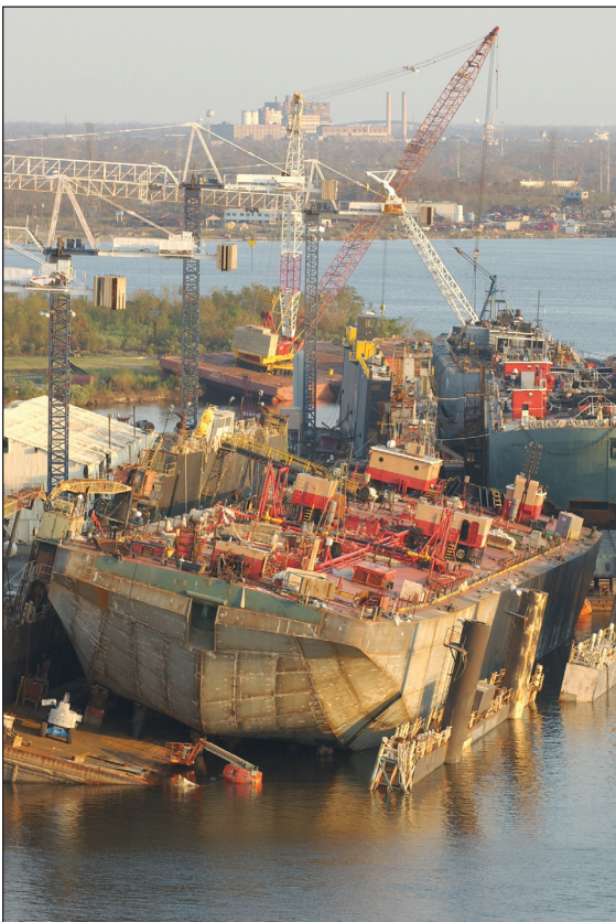
A large ship in a port outside the city of New Orleans is damaged as result of Hurricane Katrina.

federal regulations and FEMA guidelines; and its plan for completing 14 improved projects appears reasonable. However, PONO has not completed the allocation of insurance proceeds to its projects and did not use all approved funding in completing certain projects. As a result, FEMA should allocate approximately $2.6 million of insurance proceeds to PONO’s projects and disallow those amounts from the projects as ineligible, and deobligate $670,974 in approved project costs that exceeded the actual amounts incurred and claimed. In addition, Governor’s Office of Homeland Security and Emergency Preparedness (GOHSEP) overpaid PONO $1.4 million; however, we did not question these costs because FEMA funding was not involved.