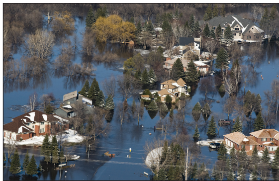
The Riverview section of Fargo is experiencing flooding.

Since hurricanes Katrina and Rita, FEMA has disbursed more than $7 billion in Individuals and Households Program disaster assistance program payments. The susceptibility of this program to fraud, waste, and abuse requires increased vigilance on the agency's part in order to be a better steward of taxpayer money. The agency's Fraud Prevention and Investigation Branch (FPIB) has succeeded in identifying and reporting potential fraud to our Office of Investigations, but is hampered by a limited mandate, inadequate staffing, and outdated IT. FEMA's leaders must do more to demonstrate fiscal responsibility and program integrity. Internal controls have improved, but we, the Government Accountability Office (GAO), and FEMA continue to identify needed actions.