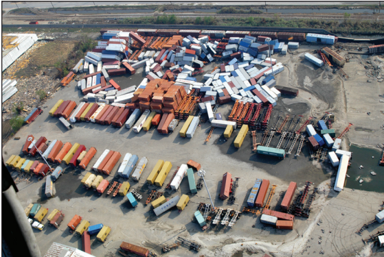
New Orleans, September 20, 2005 - Shipping containers at the Port of New Orleans are tossed about a staging area.

Port of New Orleans (PONO) accounted for and expended FEMA grant funds according to