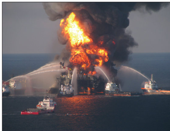
Fireboat response crews battle the blazing remnants of the offshore oil rig Deepwater Horizon on April 21, 2010.

We planned this audit to determine whether USCG has adequate policies, procedures, and internal controls to accurately capture direct and indirect costs for the Deepwater Horizon oil spill. We determined that USCG has adequate policies, procedures, and internal controls to accurately identify and bill direct costs for this oil spill.