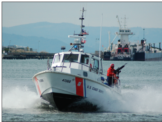
USCG's 41-foot Utility Boat.

operating procedures for future acquisitions. USCG concurred with both recommendations and has taken correction action to address them. (OIG-11-82, May 2011, OA)