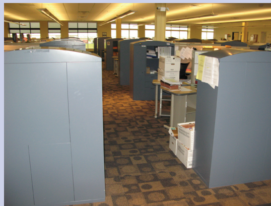
Stages of Processing Alien Registration Files Containing Personally Identifiable Information