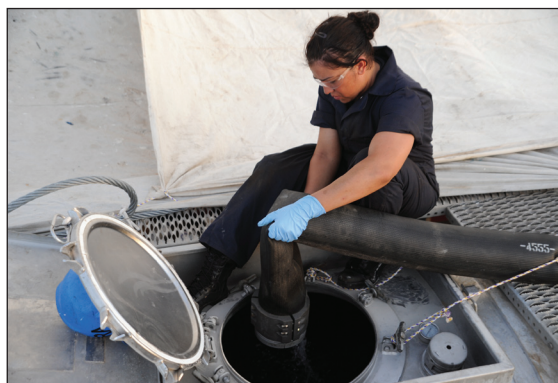
A USCG crewmember monitors a hose transporting an oil-and-water mix from the Spilled Oil Recovery System.