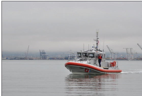
USCG's Response Boat-Medium.

We conducted an audit to determine whether Anti-Deficiency Act (ADA) violations occurred through improper use of appropriations during the administration of the Response Boat-Medium Major Acquisition project between fiscal years 2004 and 2009. We determined that USCG exceeded its appropriated funding for the Response Boat-Medium project during fiscal years 2004 through 2009. We recommended that USCG notify the Secretary that it incurred 20 ADA violations totaling approximately $7 million and identify the names of the responsible parties. We also recommended that USCG revise its standard