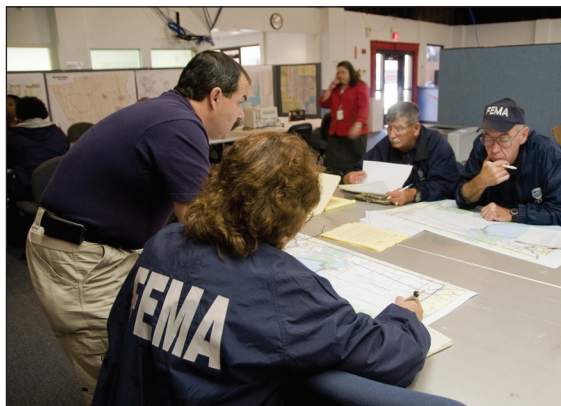
Planning meeting with FEMA personnel.

We made eight recommendations, that, when implemented, will improve fraud prevention efforts. These recommendations include: (1) an agency-wide mandate to review claims of fraud, waste, and abuse, additional staffing, and fraud prevention tools for the FPIB; (2) annual fraud prevention training for all FEMA employees; (3) continual improvement of internal controls; and (4) resolution of the 167,000 cases ($643 million) of potential improper payments disbursed since Hurricane Katrina, which FEMA began to collect in March 2011.